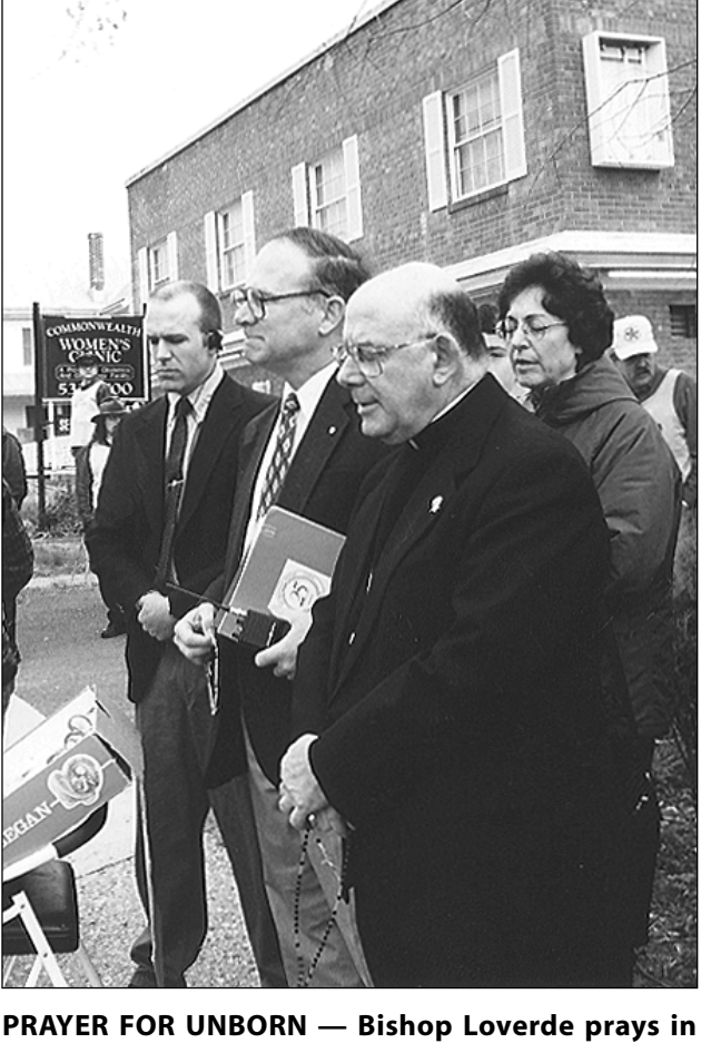
front of a Falls Church abortion clinic on Holy Satur-