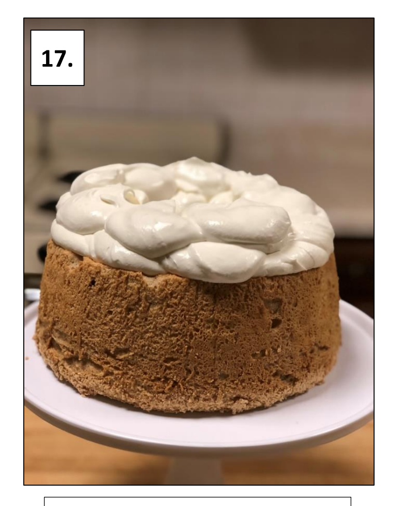
Keep piling on top, then decorate