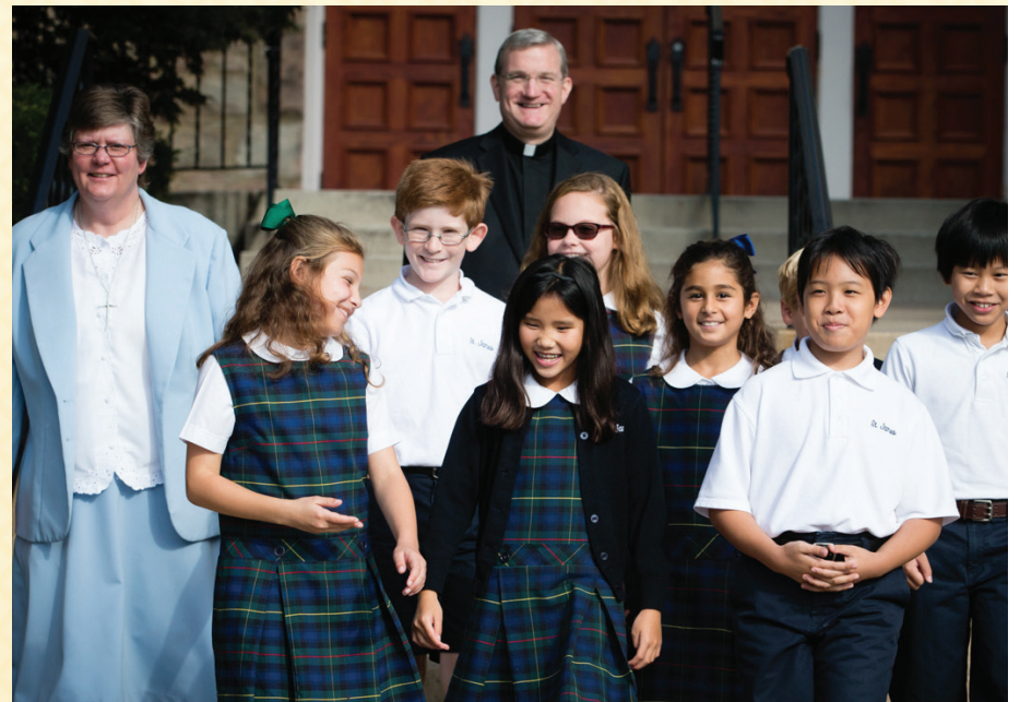
St. James Catholic School

In carrying out this mission, The Foundation serves as a resource to the diocese, parishes, schools and parishioners.