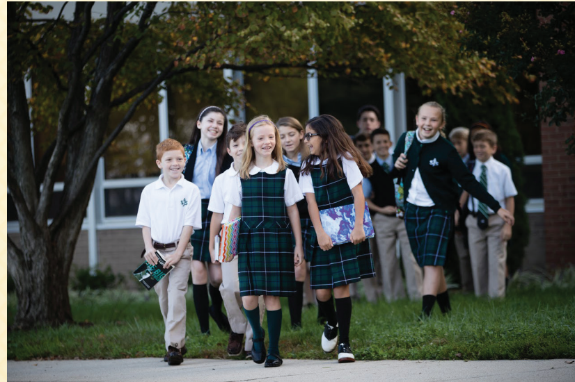
St. Joseph Catholic School Students

In carrying out this mission, The Foundation serves as a resource to the diocese, parishes, schools and parishioners.