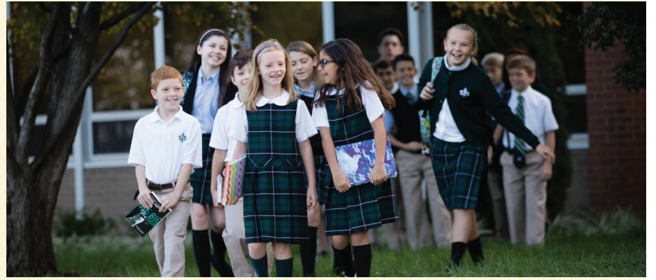
St. Joseph Catholic School Students