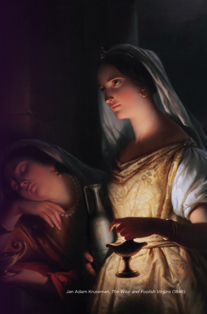
Jan Adam Kruseman, The Wise and Foolish Virgins (1848)