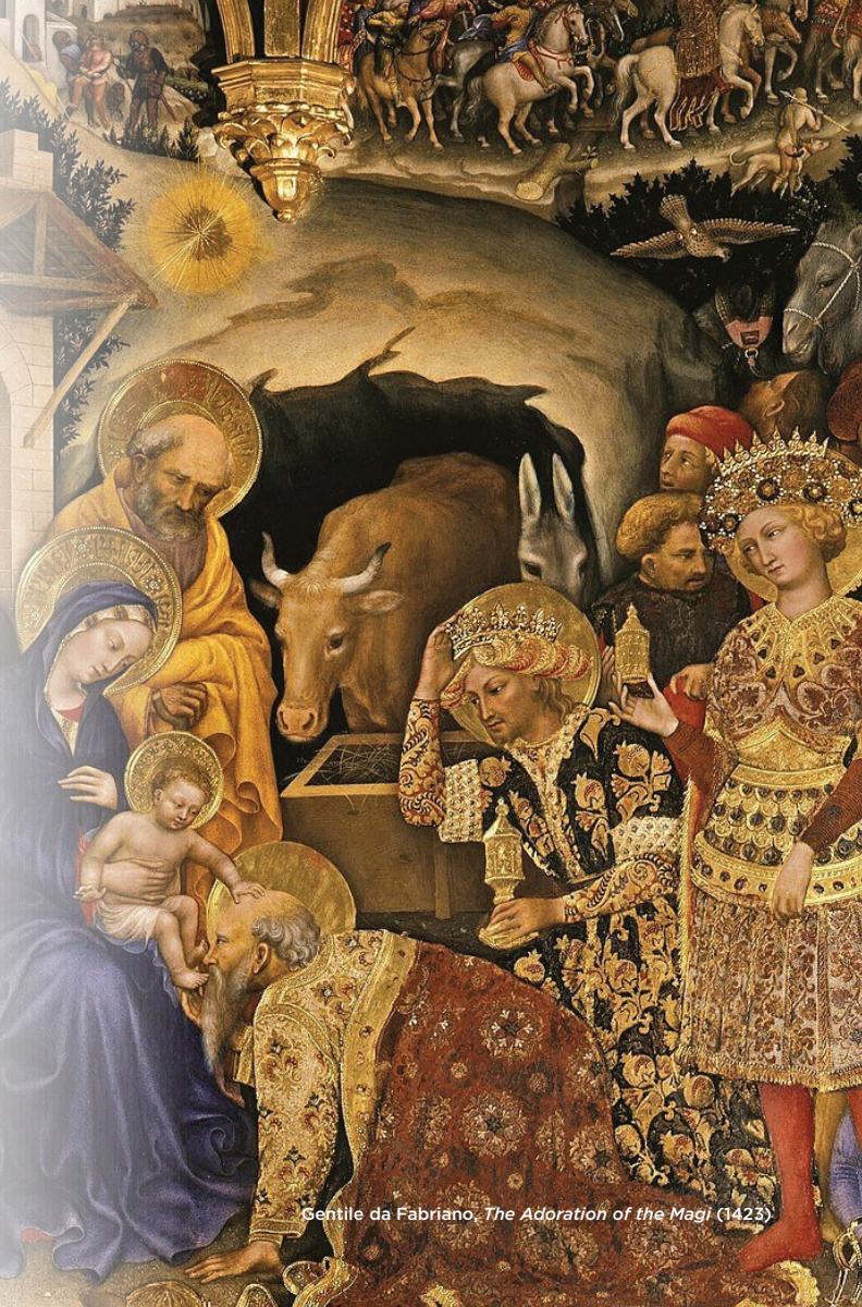
Gentile da Fabriano. The Adoration of the Magi (1423)