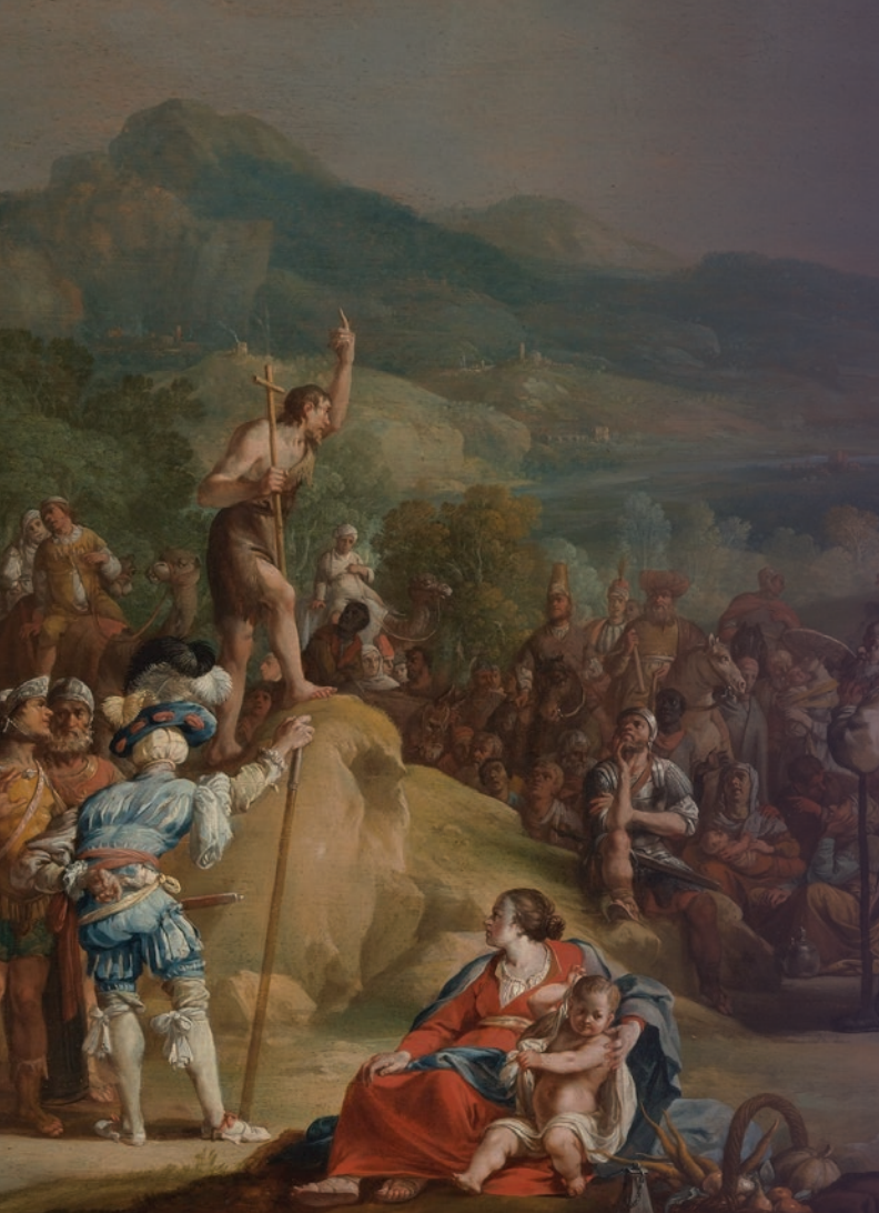
Bartholomeus Breenbergh, The Preaching of John the Baptist (1634)