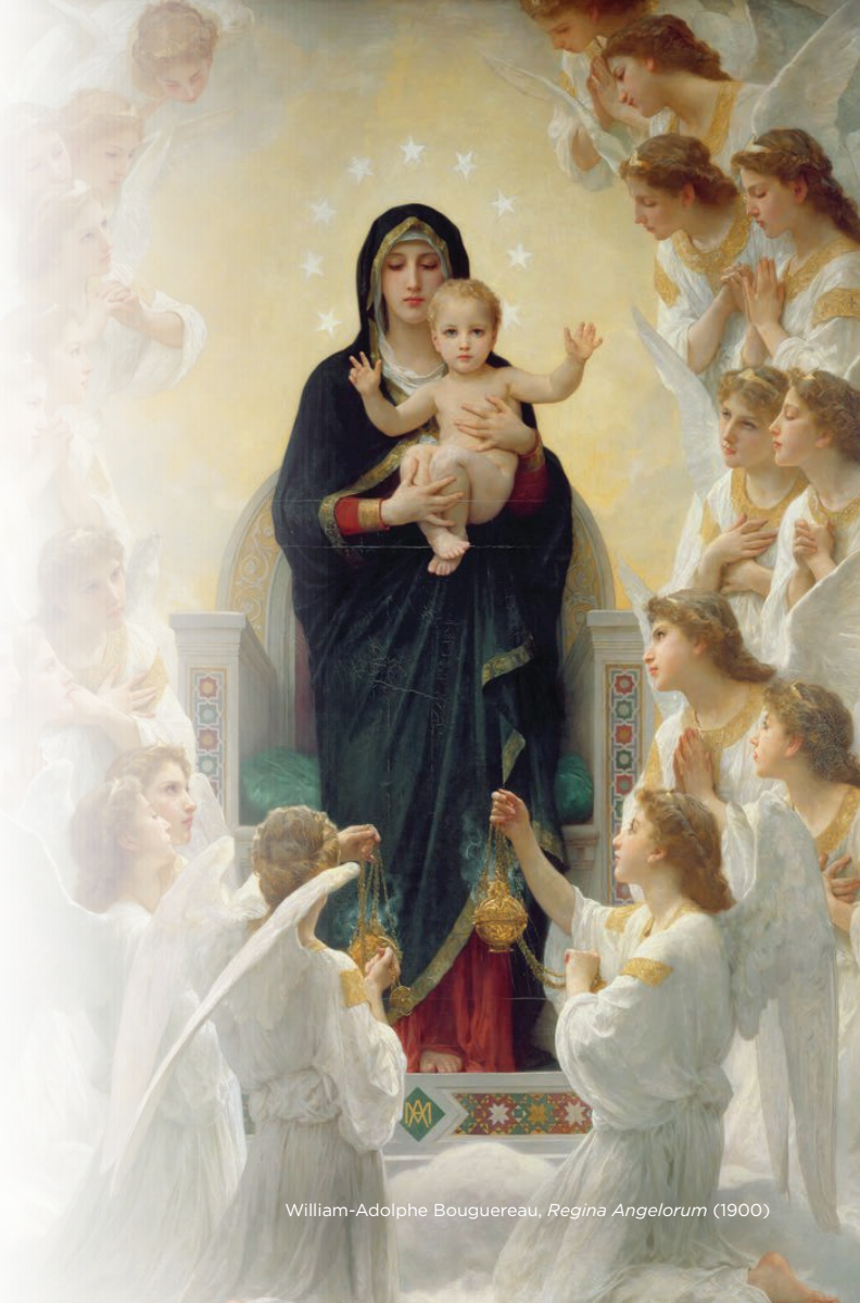
William-Adolphe Bouguereau, Regina Angelorum (1900)