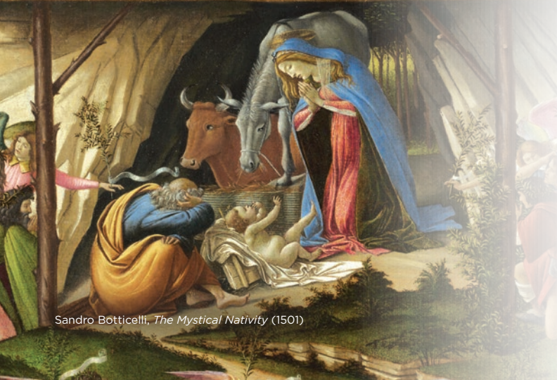
Sandro Botticelli, The Mystical Nativity (1501)