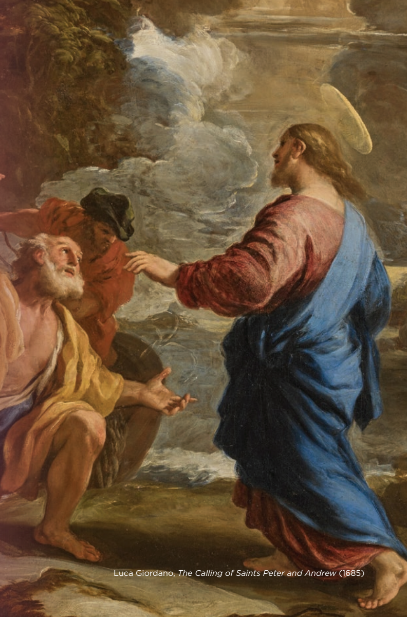
Luca Giordano, The Calling of Saints Peter and Andrew (1685)