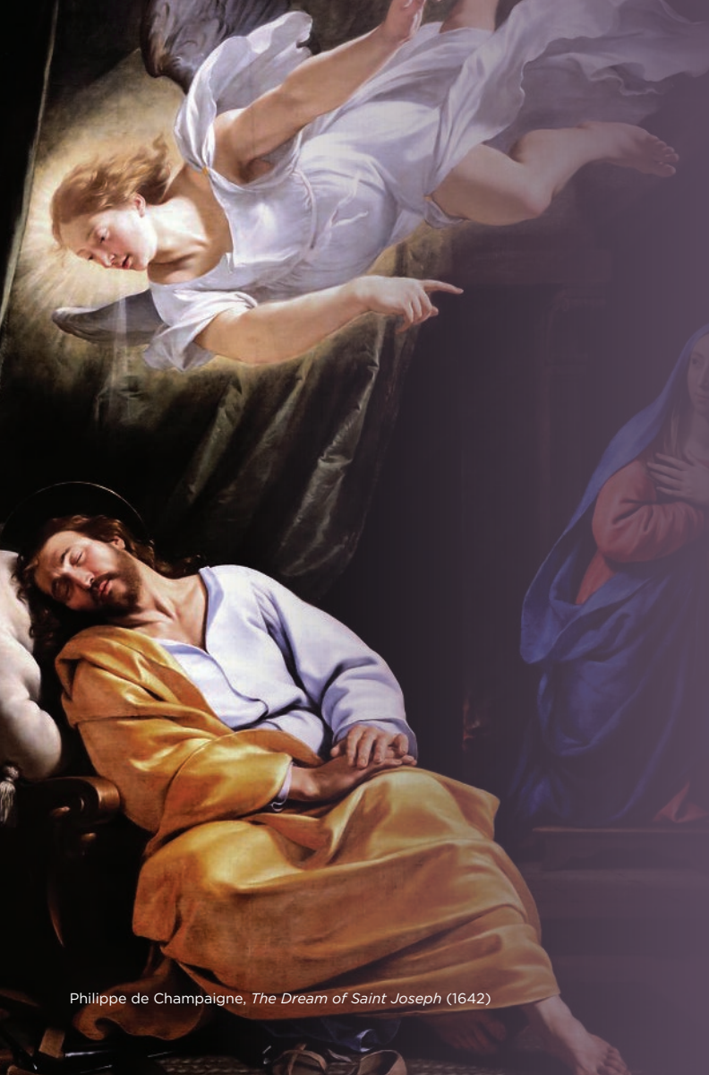
Philippe de Champaigne, The Dream of Saint Joseph (1642)