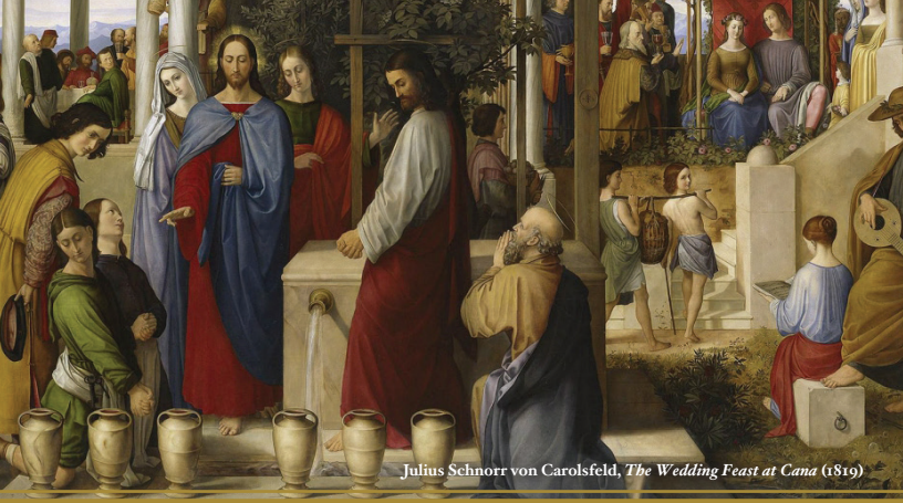
Julius Schnorr von Carolsfeld, The Wedding Feast at Cana (1819)