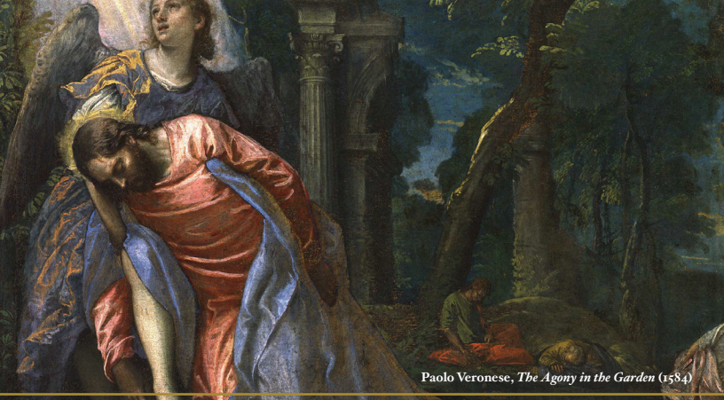
Paolo Veronese, The Agony in the Garden (1584)