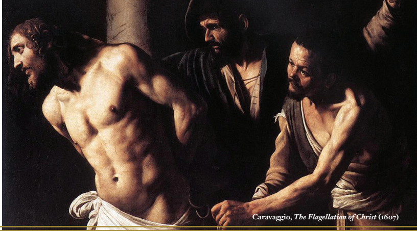
Caravaggio, The Flagellation of Christ (1607)