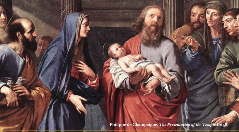
Philippe de Champaigne, The Presentation of the Temple (1648)