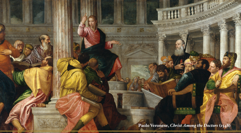
Paolo Veronese, Christ Among the Doctors (1548)