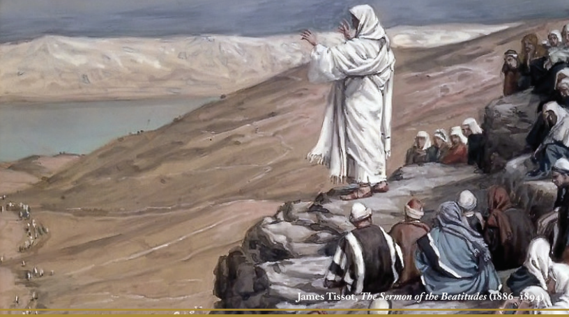
James Tissot, The Sermon of the Beatitudes (1886–1894)