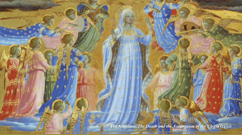
Fra Angelico, The Death and the Assumption of the Virgin (1432)