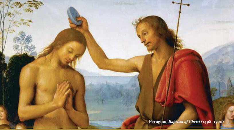
Perugino, Baptism of Christ (1498–1500)