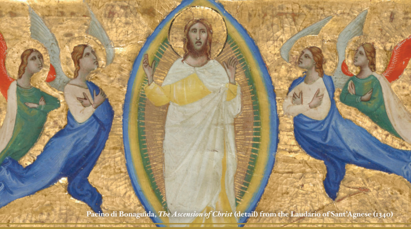
Pacino di Bonaguidi, The Ascension of Christ (detail) from the Laudario of Sant'Agnese (1340)