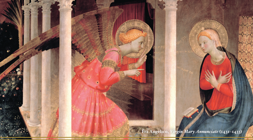
Fra Angelico, Virgin Mary Annunciate (1431–1433)