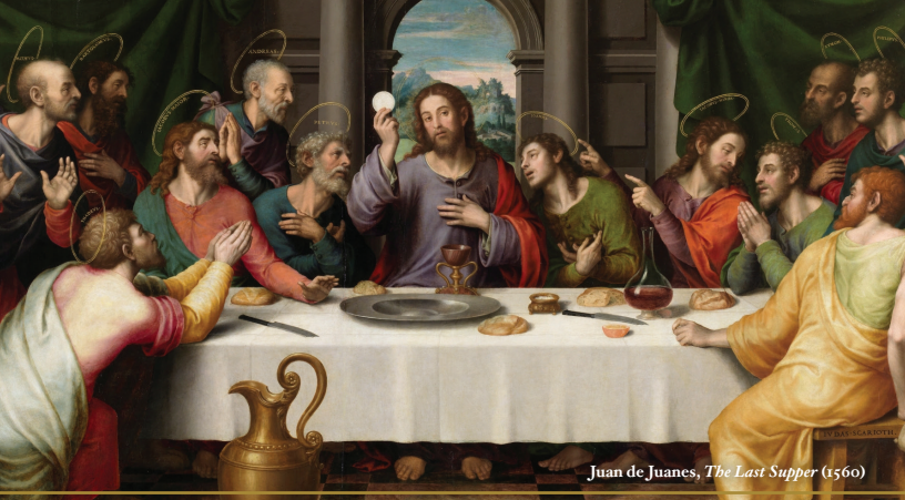
Juan de Juanes, The Last Supper (1560)