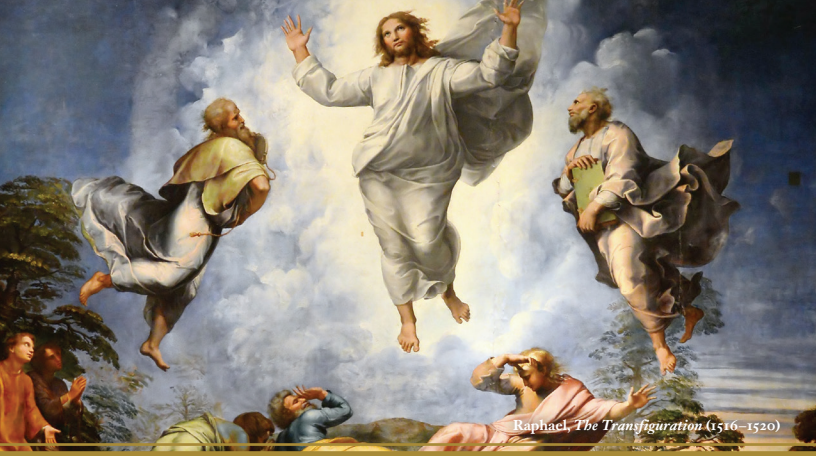
Raphael, The Transfiguration (1516–1520)