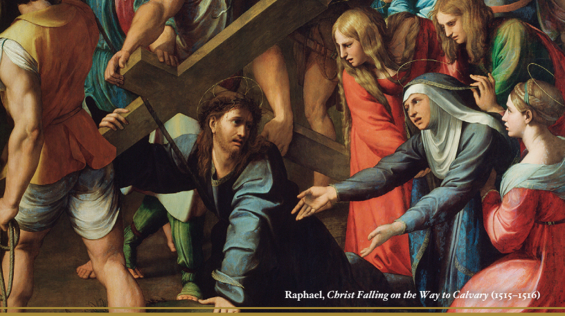
Raphael, Christ Falling on the Way to Calvary (1515–1516)