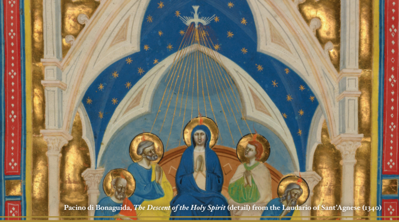
Pacino di Bonaguada, The Descent of the Holy Spirit (detail) from the Laudario of Sant'Agnese (1340)