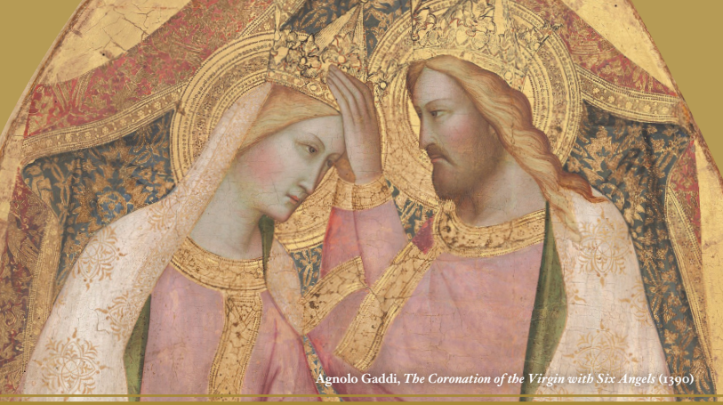
Agnolo Gaddi, The Coronation of the Virgin with Six Angels (1390)