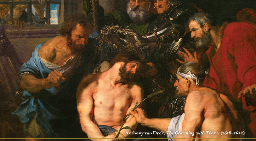
Anthony van Dyck, The Crowning with Thorns (1618–1620)