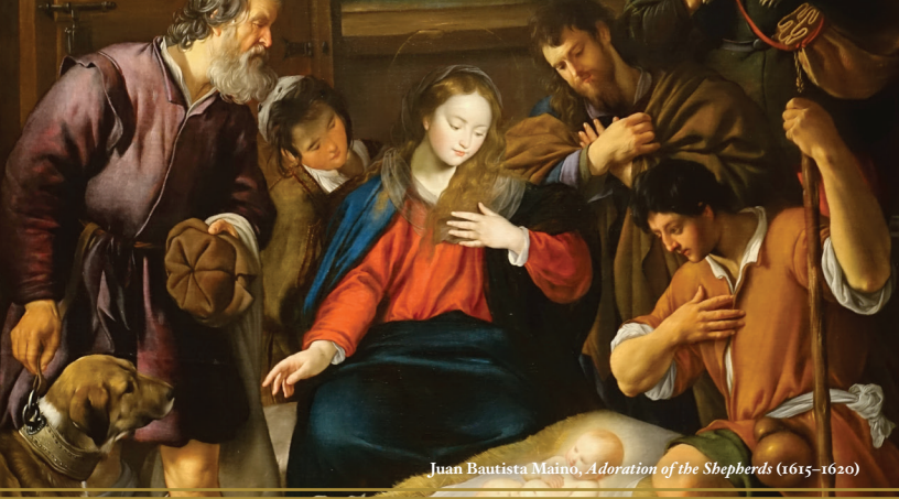
Juan Bautista Maino, Adoration of the Shepherds (1615–1620)